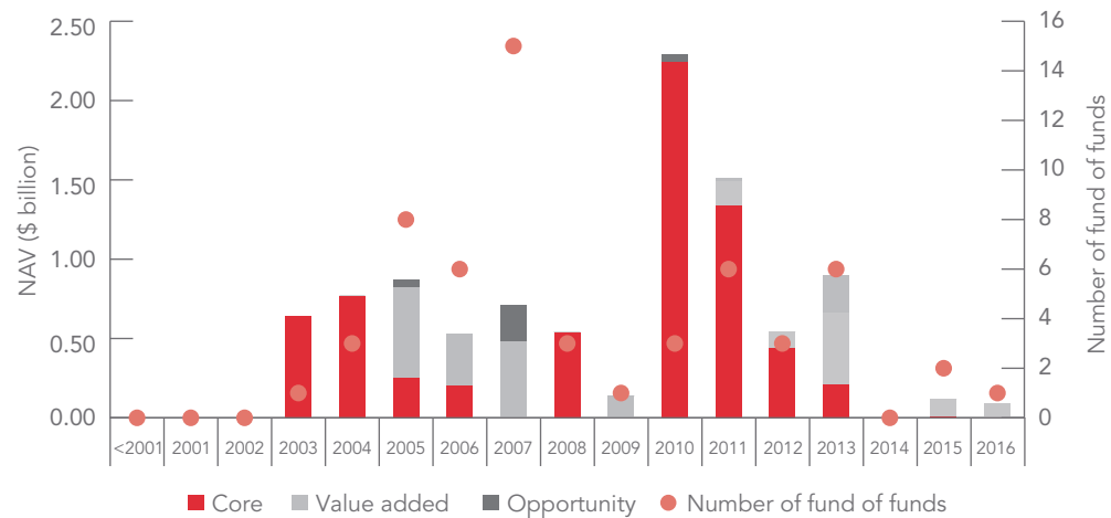
Figure 2 - New vehicle launches

'Very few new funds of funds have been launched over the past few years'